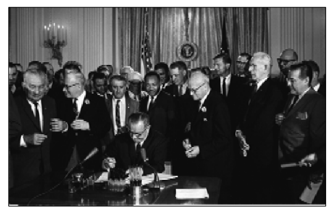
Pres. Johnson signing Title VII