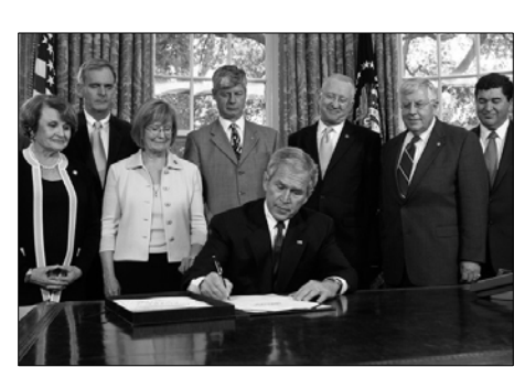
Pres. G.W. Bush signing GINA

The fiscal 2012 appropriation for EEOC represents about a $6.6 million cut from its approximately $367 million funding level for fiscal 2011. –DLR 11/17/11