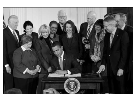
Pres. Obama signing Ledbetter Act