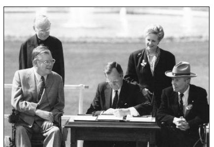
Pres. G.H.W. Bush signing ADA