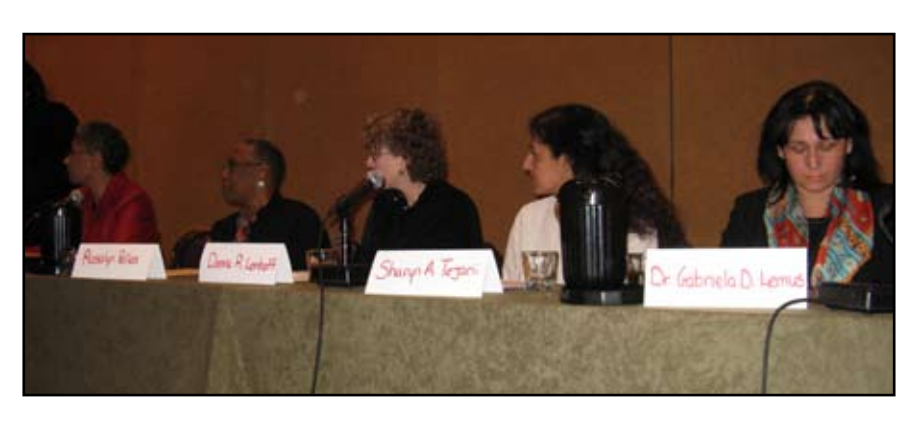
Panel members at the EEOC workshop at the AFGE Legislative Conference

This is not the kind of change Miami EEOC employees had in mind. Micromanagement is the biggest obstacle preventing staff from helping the public. Instead of the director, deputy, and supervisors henpecking employees about deadlines, management could process backlogged cases themselves. The public would be better served having more people working on more cases than having a tripartite of supervisors micromanaging investigators on each case.