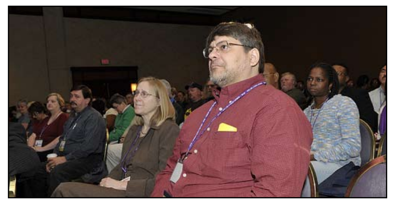
Above: AFGE Legislative Conference attendees. Speakers at the three day conference included AFGE International officers and department heads, AFGE executive council members and members of Congress.

National Council of EEOC Locals 216 AFGE/AFL-CIO 80 F Street Washington, DC 20001