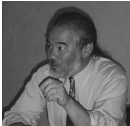
Commissioner Stuart Ishimaru addresses the delegates of the National Council at its August meeting.